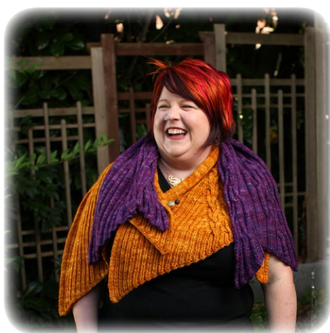
Tildes layer beautifully!

Both sides of one of Cat's magical reversible cables. You'll learn the simple rule that produces reversible cables, which are nearly always quite distinct.