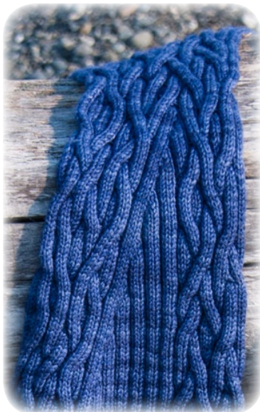
Let The River Carry You...

Skill level: Must be able to do the following without supervision : knit ribbing without confusion; knit 2 sts together (k2tog, a right-leaning decrease), SSK (slip, slip, knit, a left-leaning decrease), pick up and restore a dropped stitch, slip a stitch purlwise, any long-tail cast-on, and be curious and eager to learn new things!