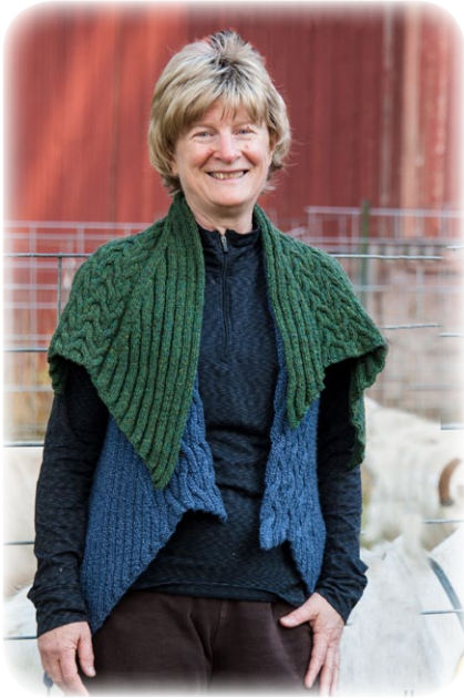
Cat wearing a Tilde wrap over a tunic-length Tilde vest.

like a living landscape. Fins and Fields intersect a River that is fierce on one side and tranquil on the other. Tildes are so versatile that they can become wraps, scarves, and vests (all included in the book).